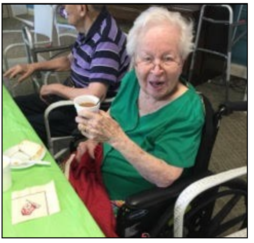
Resident with Lap Quilt and Coffee

Each July UMW Circles take turns hosting a coffee at The Hermitage on Westwood Avenue. On July 19, Circles 5 and 6 participated. We brought 100 bags of cookies, cheese