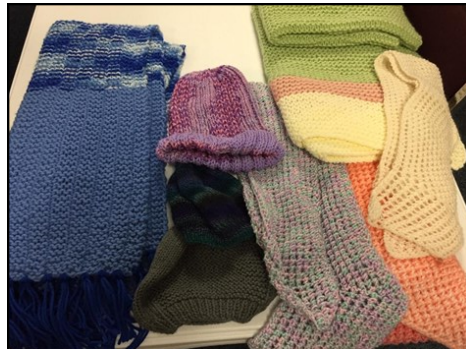
Scarves, Shawls, Hats