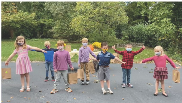
12 first graders received their bible this fall; thank you to the McClure Sunday School class for their generosity!

Parents receive an email each Sunday morning at 8am with all of the links to access the Kids Church Online video, Parent Guide, and Zoom Call.