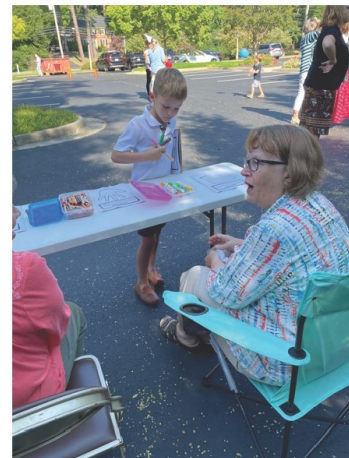
Join us at our next Parking Lot Party on October 17 th at 10am OUTSIDE in the parking lot!