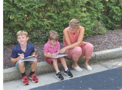
Families had a great time at our Parking Lot Party in September!

Transit is our ministry for 4 th and 5 th grade students. We will be gathering for an evening of games, fellowship, and bible study once a month from 5-6:15pm on these evenings: October 17 and November 21. This is a great opportunity for our 4 th and 5 th graders to gather together and invite a friend to join them! Watch for texts and emails about other opportunities for this age group!