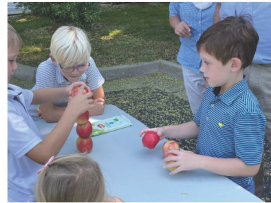
We played some fun games, participated in prayer stations, and enjoyed popsicles!

We had a blast in September on our Mystery Fun Day at Patterson Golf Park! Our next Mystery Fun Day is Monday, October 11 th . Please contact Jen if you are interested in joining us for this next fun adventure!