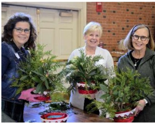
Christmas centerpieces for UMFS, the Hermitage & Covenant Woods