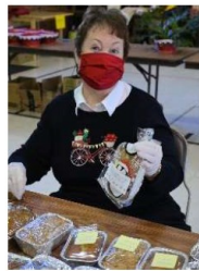
Health kits for MHEC Bags of cookies and notes of encouragement for AA