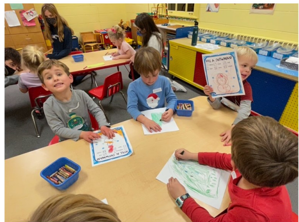
Our January Series: A Day at the Museum