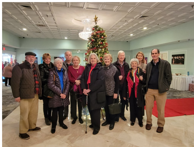
YAH's trip to see Miracle on 34th Street.