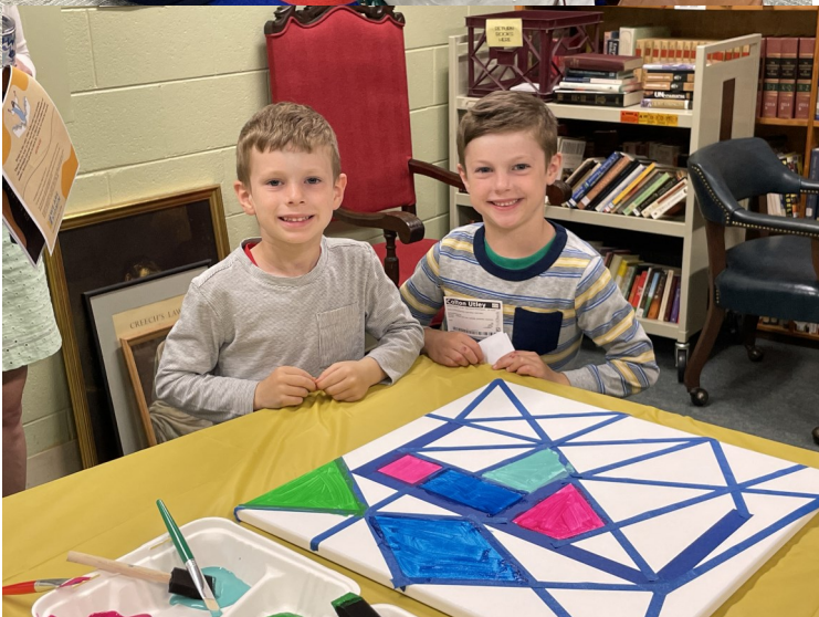
Events that took place the end of February and in March!